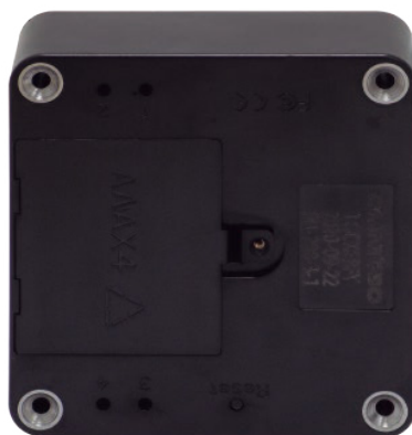
LOCKERFY BLE | CODE | RFID